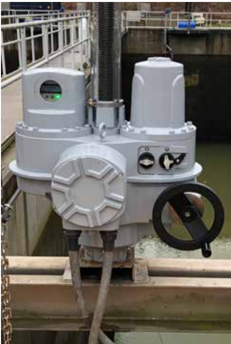
Backwash EQ Basin Inlet Gate