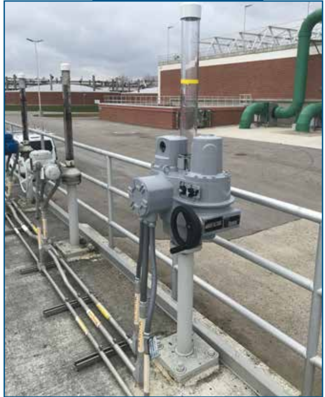
Primary Clarifier Inlet Gate